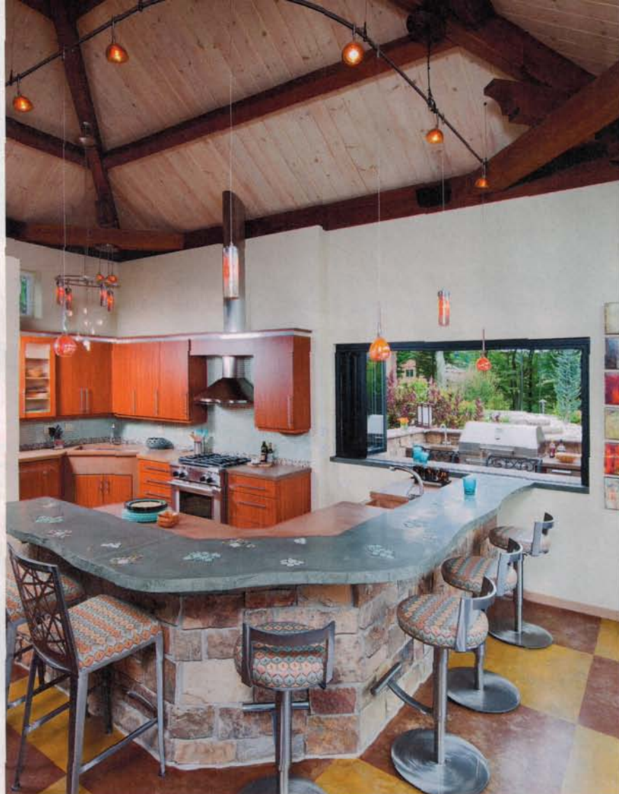
LEFT: The oversized kitchen window provides convenient access to the grill and outdoor counter.

Instead of patio doors, the couple installed glass Nana walls that, in the warm weather, open up to connect the inside and outside. They were carefully designed with a threshold that blends into the concrete, catching all water deposits, and eliminating any sort of tripping hazard. There is forced heat and air-conditioning, and floors have radiant heat to keep feet warm after a dip in the pool.